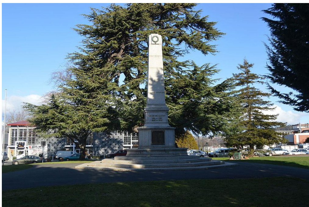
Launceston War Memorial